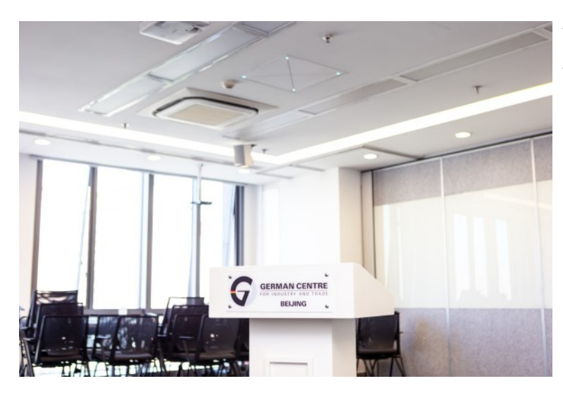
The German Centre Beijing installed two Sennheiser TeamConnect Ceiling 2 microphone units in its Stuttgart meeting room

Beijing, 21 October 2021 – The German Centre Beijing provides modern office spaces, offers conference and meeting facilities, and supports companies with practical advice and services. Located at the heart of Beijing's business and diplomatic district, the German Centre takes care of the complete workspace infrastructure, so that tenants can entirely focus on their business. Since 1999, more than 500 companies have used the German Centre Beijing to start and grow their business in China. Currently, its 17,000 sqm space is home to more than 70 companies.