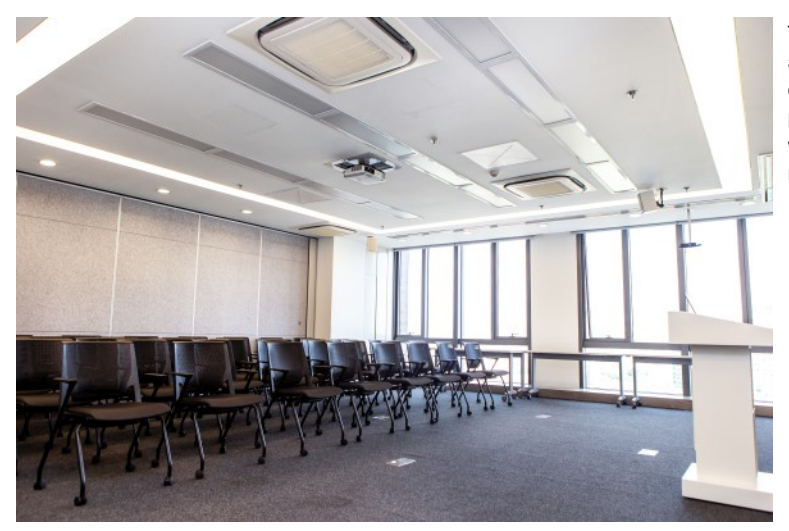
TruVoicelift ensures a clear and pleasant listening experience for all participants, no matter where they are seated in the room

TCC2 proved to be the perfect audio and conferencing solution for this space thanks to its adaptive beamforming technology and TruVoicelift functionality, which significantly increases speech intelligibility in a meeting or conference room, allowing participants to be heard clearly from every corner of the room.